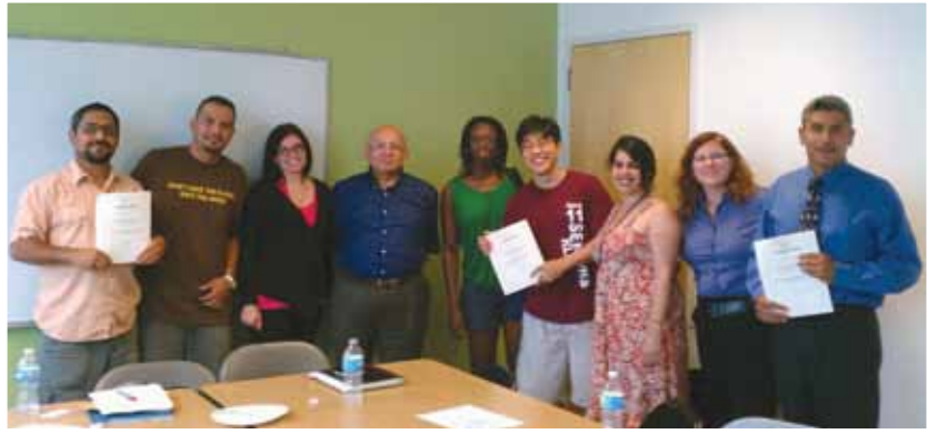
Rudy Lozano teachers, administrators and negotiators are all smiles after reaching a tentative contract agreement.

It is disheartening to see our profession being blamed for all the ills in public education today,